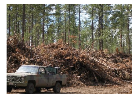
Figures 2. Forest residuals dispersed across ground and collected into in-unit piles (left); along roadsides (center), and at central landings/processing sites (right).

Forest Concepts uses the Appreciative Design Method to guide the development and specification of new products, processes, and equipment (Dooley and Fridley 1996; Dooley and Fridley 1998). The Appreciative Design Method merges elements of soft systems and social network analysis with traditional engineering design to establish functional requirements, operational objectives, and constraint sets that limit selection of design attributes and features.